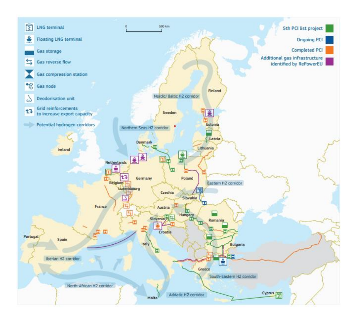
European infrastructure map for electricity