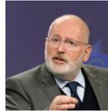
Frans Timmermans Executive Vice-President European Green Deal

A new Commission team to deliver on Green Deal objectives for coal, peat and oil shale regions.