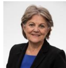
Elisa Ferreira Cohesion and Reforms