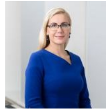
Kadri Simson Energy