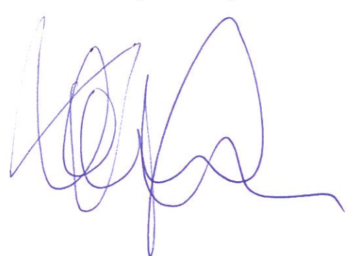
For the Republic of Poland