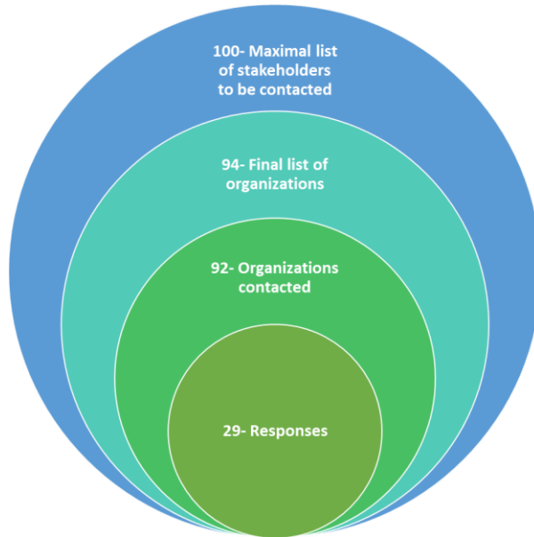
Figure 2: Summary of stakeholder engagement in the process

In four cases, the stakeholders expressed their interest to review a broader scope of data than originally requested and provided a broad scope of reviews, covering the full range of technologies under the review.