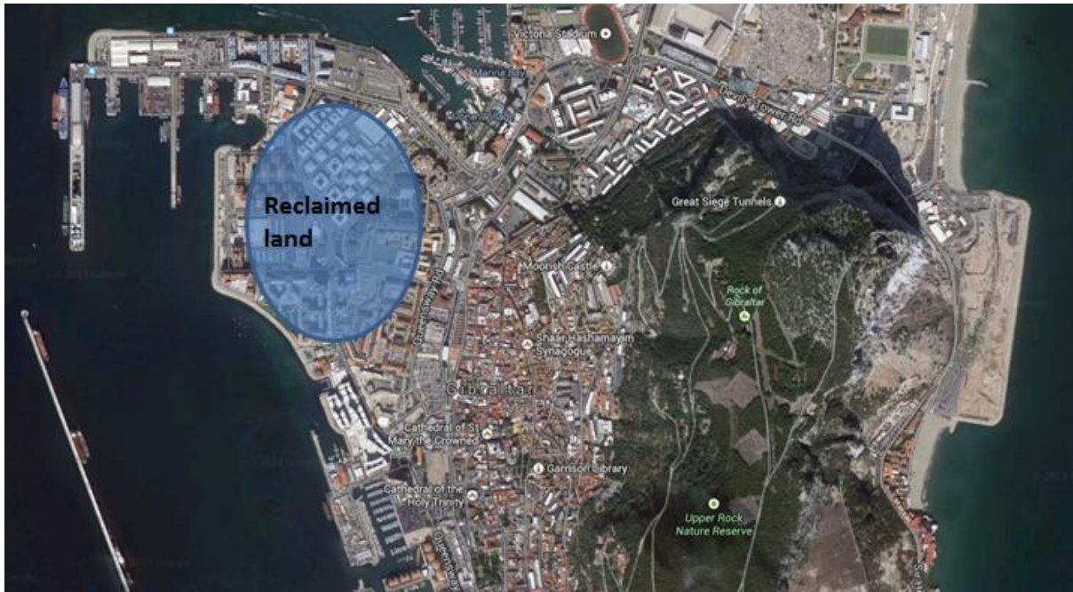
Figure 2 Area of reclaimed land in which buildings were constructed in the 1990's (blue).