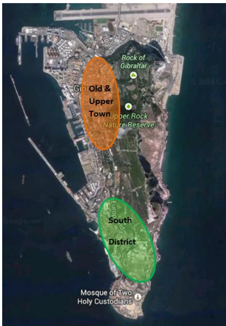
Figure 1 The Old & Upper Town (orange) and the South District (green) of Gibraltar.

Figure 1 shows a map of Gibraltar indicating the approximate location of the different defined areas: