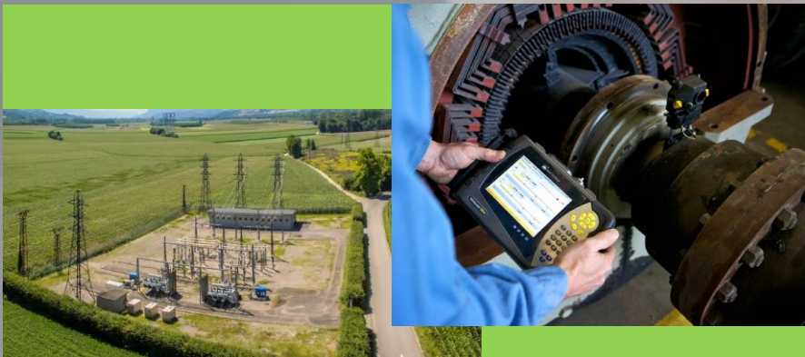
Investments & Operations