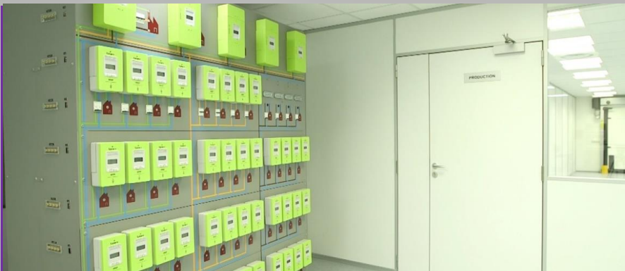
Smart meter roll-out