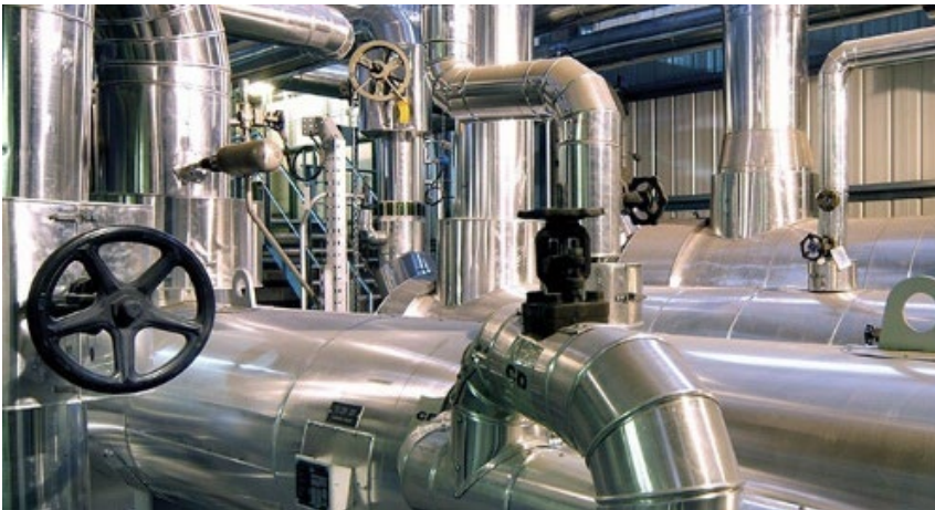
District energy systems