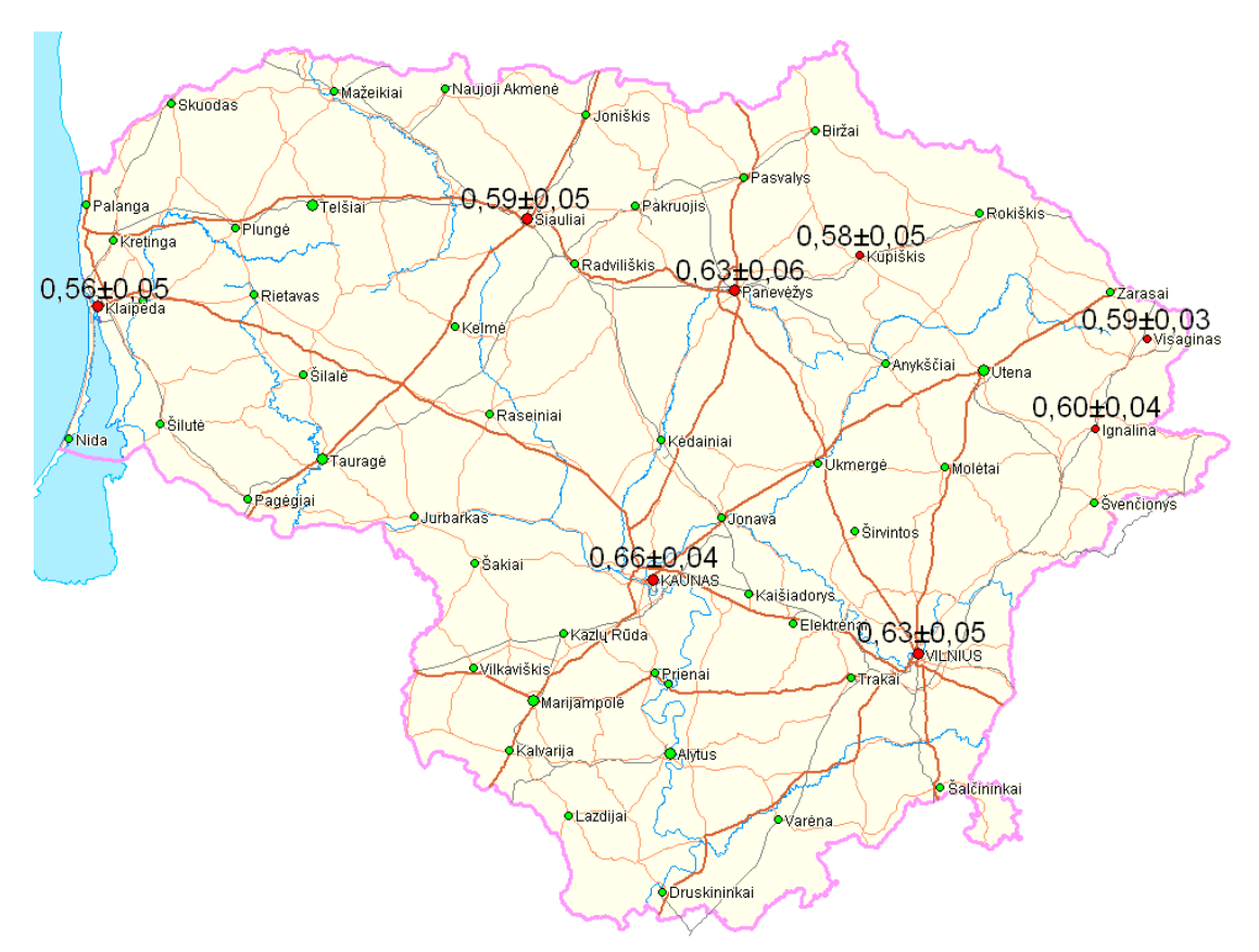
Figure 2. TLD measurement areas and their measured average doses in 2010 (mSv)

TLD locations are unmarked and open to public access. RPC staffs in charge of the monitoring programme use GPS coordinates to find the TLDs. Figure 2 presents the monitored areas and their measured average annual doses in 2010.