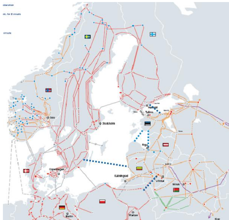
Figure 3: Interconnections in the Baltic area