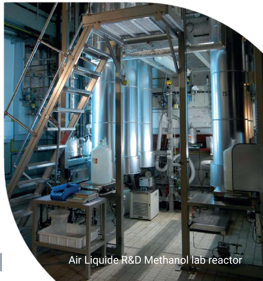
Air Liquide R&D Methanol lab reactor