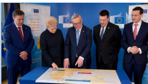
◀ In March 2018 President Juncker and the Heads of State or Government of the Baltic States and of Poland commit to synchronise the Baltic States' electricity grid with the continental European System by 2025.