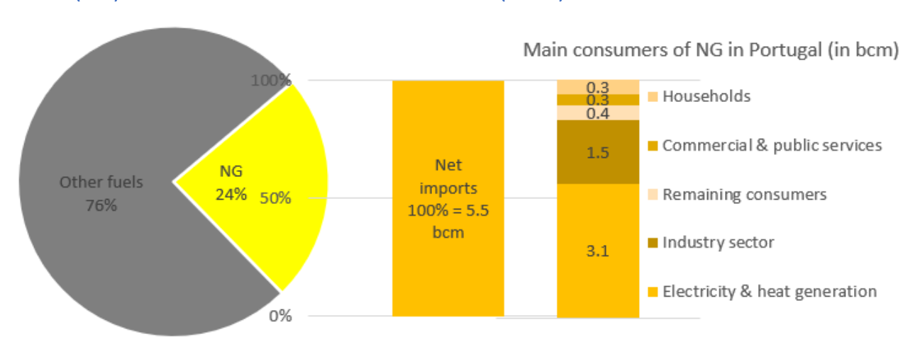
Figure 3 Natural gas share in total energy supply, origin and main consumers for Portugal (2021)