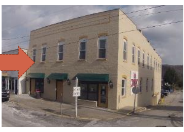
True Empowerment Opportunities for People ...