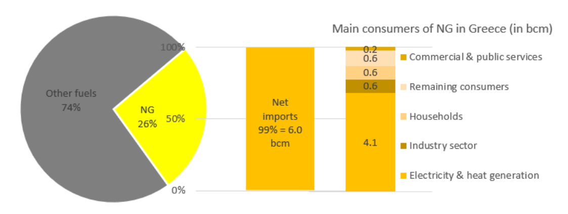
Figure 3 Natural gas share in total energy supply, origin and main consumers for Greece (2021) (source: Eurostat: Energy Balances, 2022)