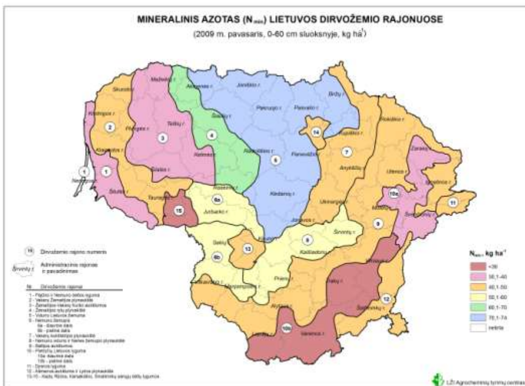
Figure 2. Mineral nitrogen content in the Lithuanian soil in spring 2009