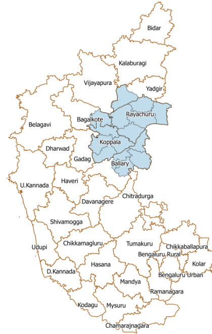
Cluster 3 Sindhanur