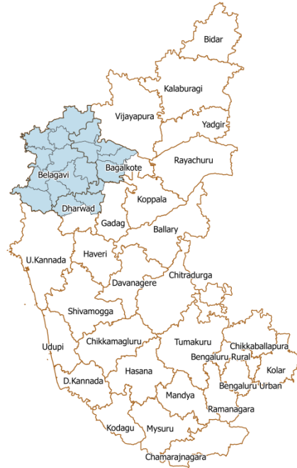
Cluster 2 Gokak