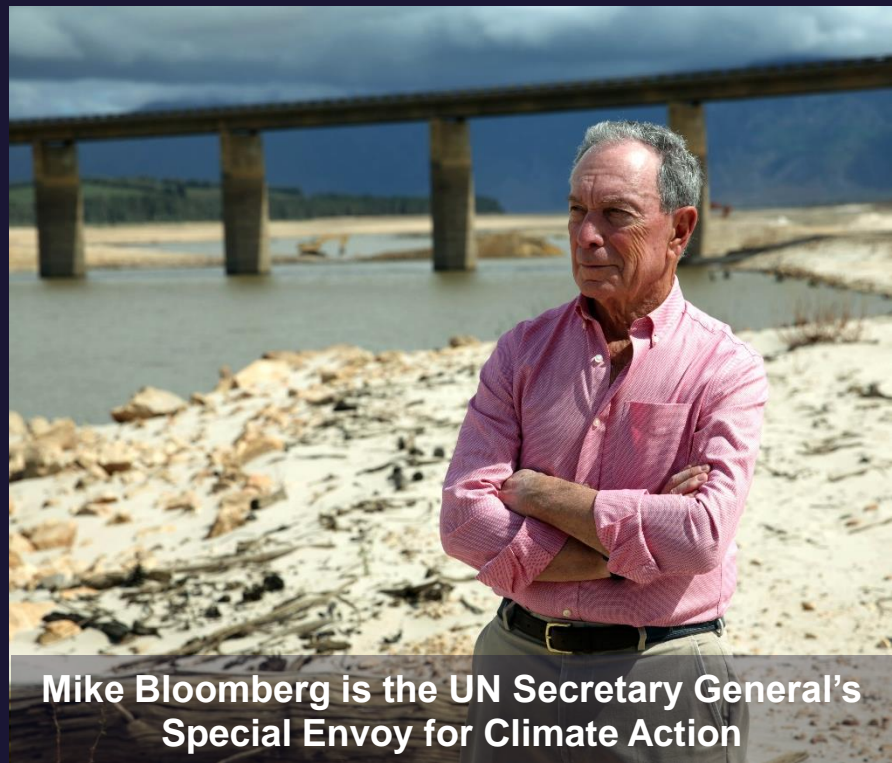
Mike Bloomberg is the UN Secretary General's Special Envoy for Climate Action

Leading the global effort to improve data on financial risks of climate change