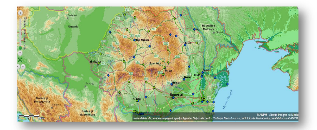
Figure 2. Automatic gamma dose rate monitoring stations in Romania