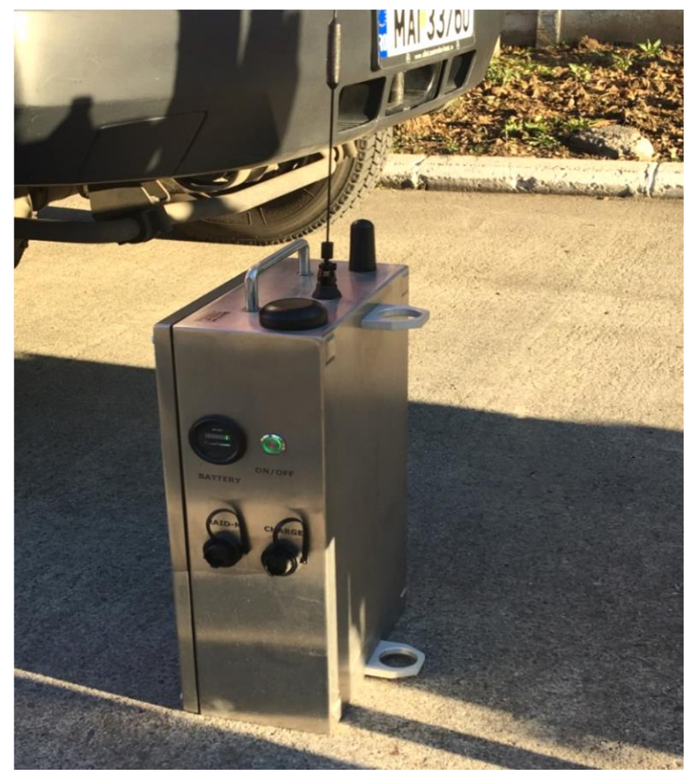
Figure 6. Independent mobile radiation dose rate monitor EXATEL ARGU-SAT