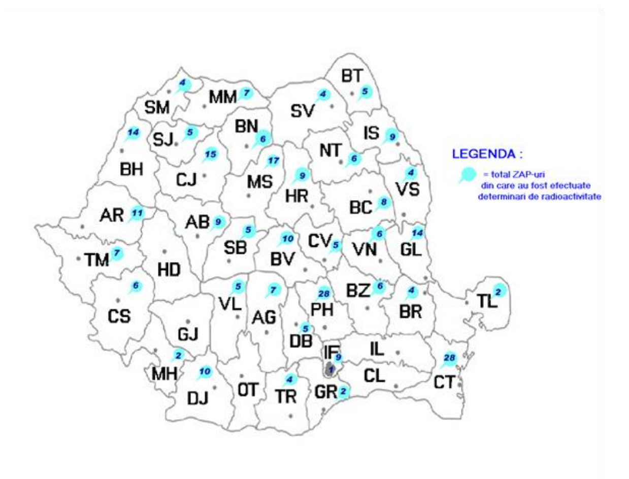
Figure 3. Water Supply Zones in Romania and the number of samples for radioactivity control

From 2017 artificial radionuclides in groundwater are analysed in the area of influence of nuclear installations only (Cernavodă NPP, Kozloduy NPP, Pitesti Nuclear Research Institute).