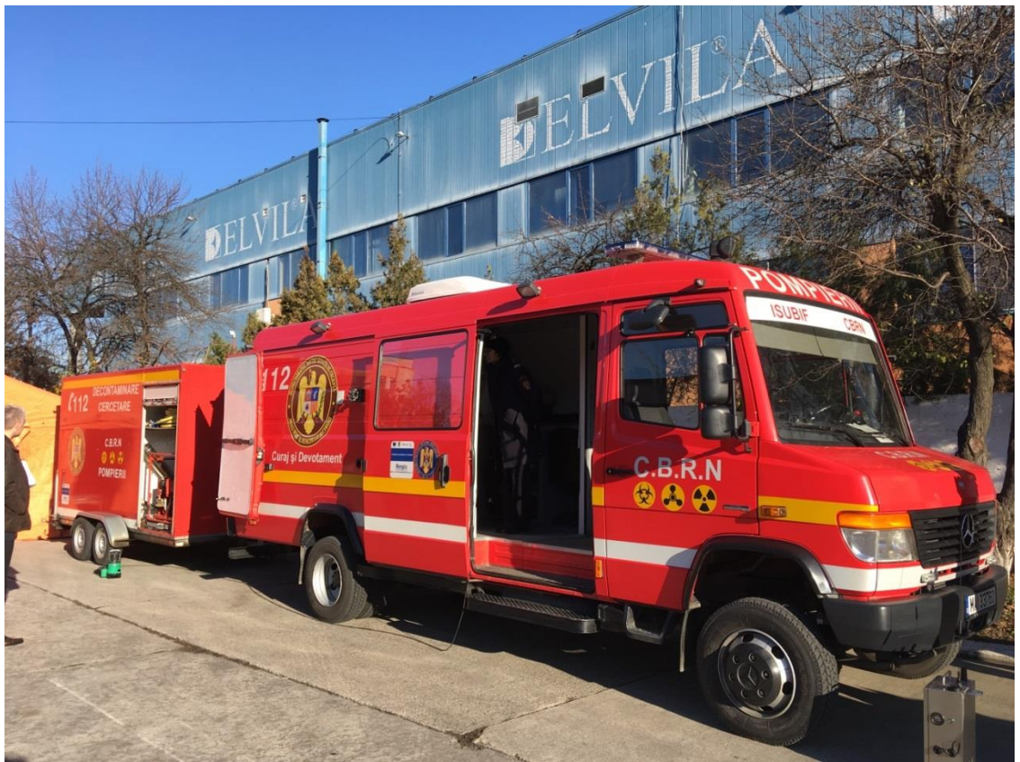
Figure 5. GIES mobile CBRN response unit