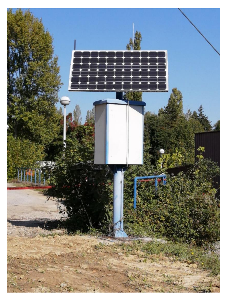
Figure 2. CEWS monitoring station (BITT) at the Ruđer Bošković Institute in Zagreb