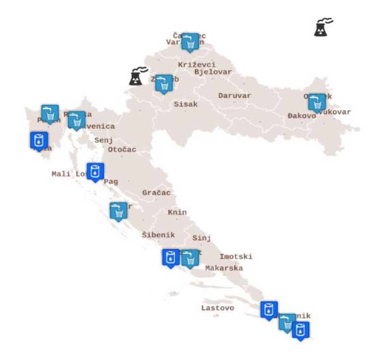
Figure 9. Ground water and drinking water sampling locations

All locations are shown in Figure 9. Samples are collected once or twice a year (except Zagreb where 1 L/day is measured quarterly). They are analysed by gamma spectrometry (anthropogenic and natural radionuclides) and beta counting (<sup>90</sup>Sr).