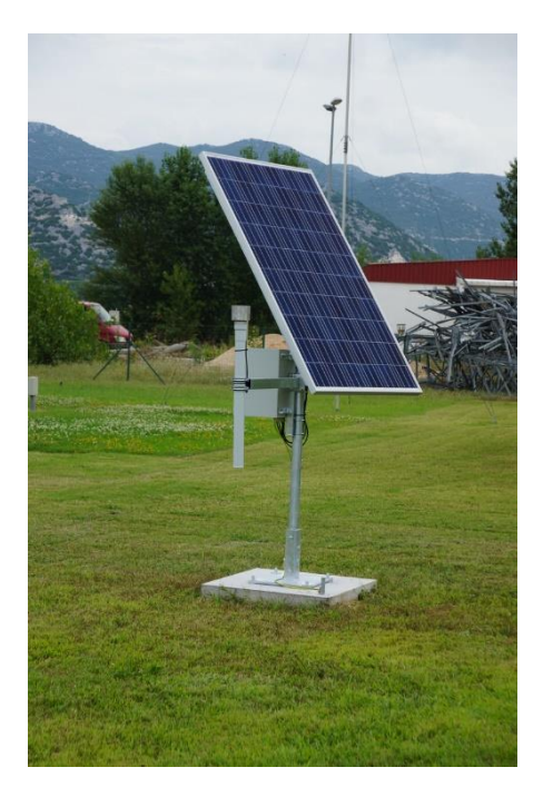
Figure 3. CEWS monitoring station (ENVINET) at Ploče