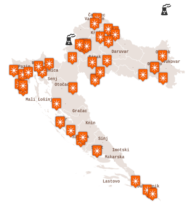
Figure 4. TLD locations

Active electronic dosimeters (AED) for measurement of dose rate are available (sensitivity: 10 nSv/h; energy range 30 keV to 4.4 MeV). In addition, there is a digital survey meter with the dose rate range from 0.1 \mu Sv/h to 0.99 Sv/h in the energy range from 36 keV to 1,3 MeV.