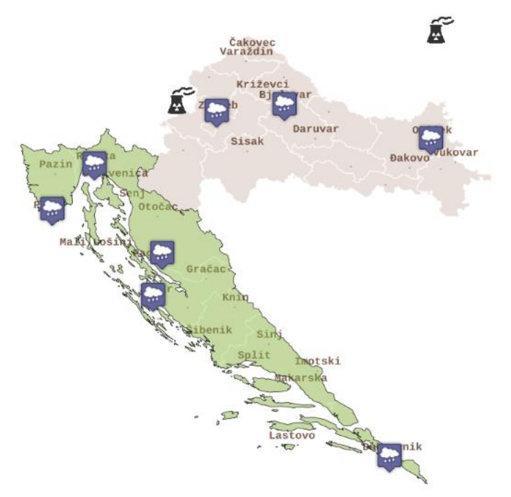
Figure 7. Deposition collection locations

Dry deposition sample is collected on a Vaseline covered plate (0,0929 m<sup>2</sup>; 1 m above the ground) at IMROH in Zagreb. These samples are collected continuously during three months and then measured by gamma spectrometry; anthropogenic and natural radionuclides are determined.