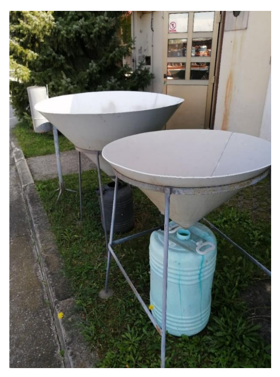
Figure 17. IMROH wet deposition collectors