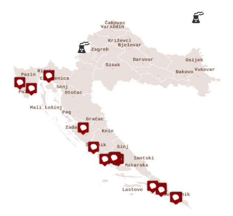
Figure 12. Aquatic (marine) biota sampling locations

Samples are collected once or twice a year. They are analysed by gamma spectroscopy (anthropogenic and natural radionuclides are determined) and beta counting (<sup>90</sup>Sr).