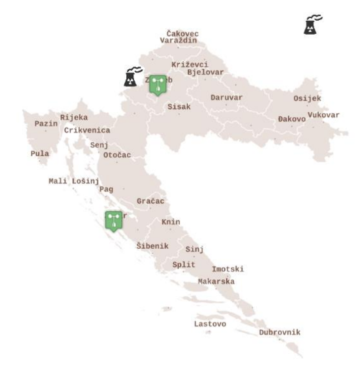
Figure 6. Air sampling locations (Zagreb and Zadar)

The second location for sampling air is in Zadar. Air is sampled on filter paper by continuously pumping about 100 m<sup>3</sup>/day (1 m above the ground). Samples are measured quarterly by gamma spectrometry (anthropogenic and natural radionuclides are determined). Total beta activity is measured daily from the same filter samples.