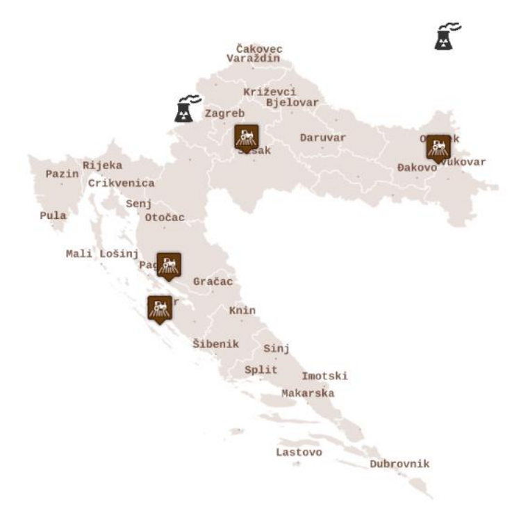
Figure 11. Soil sampling locations