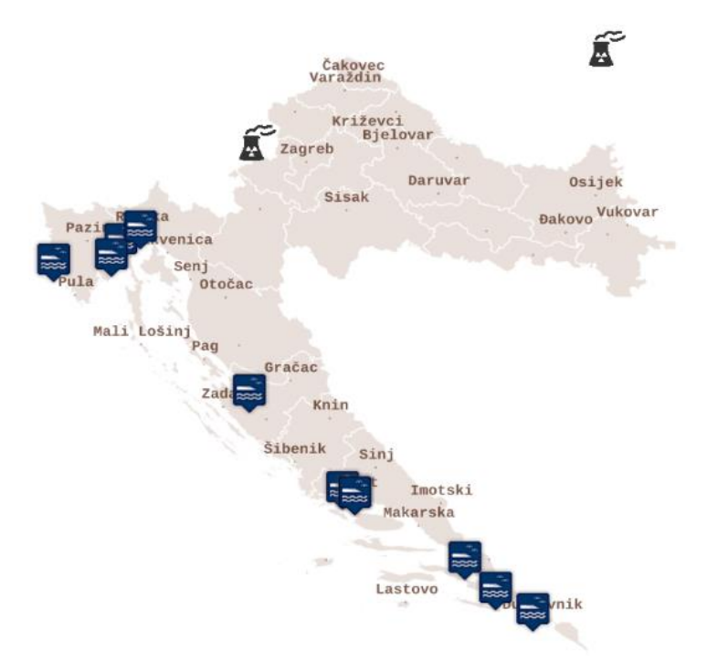
Figure 10. Seawater sampling locations

Seawater samples are collected at Rovinj, Plomin, Rijeka, Kaštela, Split and Dubrovnik (Fig. 10). Samples are collected once or twice a year. They are analysed in IMROH by gamma spectroscopy (anthropogenic and natural radionuclides) and beta and alpha counting (<sup>90</sup>Sr and <sup>226</sup>Ra).