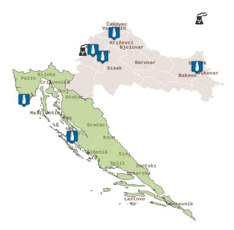
Figure 13. Milk sampling locations

Milk samples are collected at markets (Zagreb, Varaždin) and on farms (Osijek, Zadar) (Fig. 13). Samples are collected monthly (Zagreb, Osijek, Zadar) or during two months (Varaždin, Pušća). Seven litres of milk are evaporated under UV lamps, ashed at 450 °C (for gamma spectrometry) and at 650 °C (for determination of <sup>90</sup>Sr).