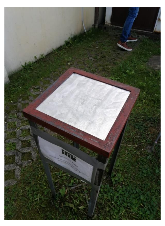
Figure 18. IMROH dry deposition collector