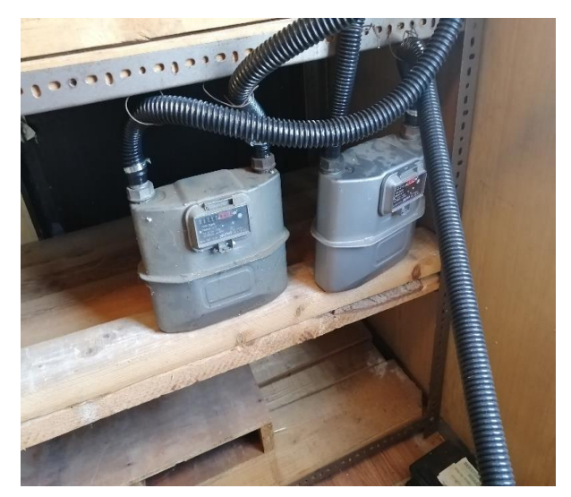
Figure 15. IMROH medium-volume air sampling pumps