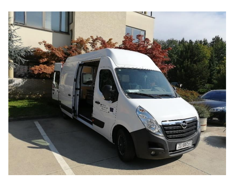
Figure 14. IMROH mobile radioactivity monitoring laboratory

Altogether four IMROH scientific staff members have been trained to operate the mobile laboratory. They take part in emergency exercises on regular basis. The van has air conditioning and a 220V power supply for long-term independent operation.