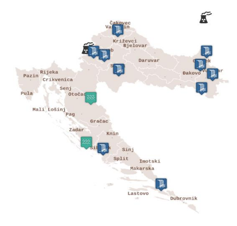
Figure 8. Surface water sampling locations