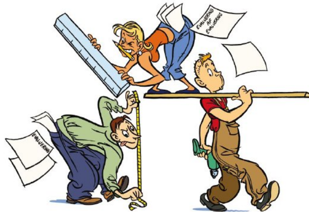
How do we plan and monitor EE