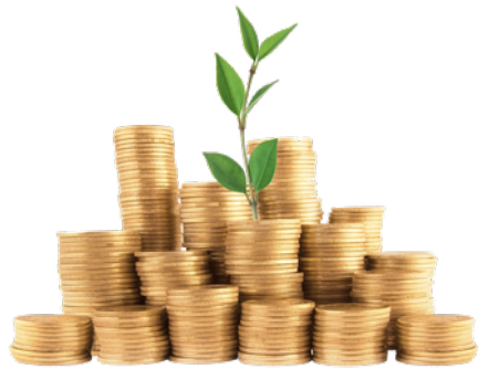
How to finance EE

Infusing our housing association with energy efficiency