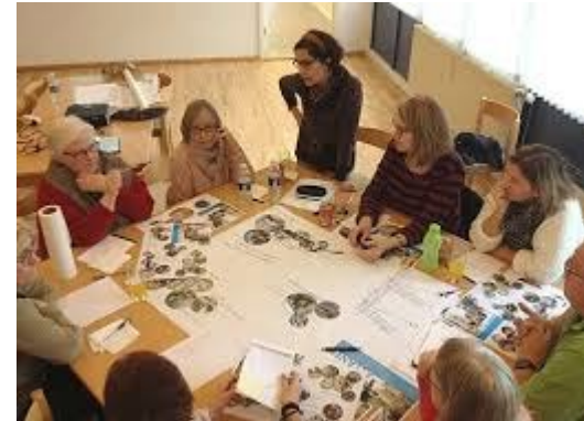
How do we engage with the tenants