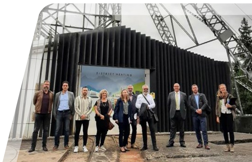
The participants visiting HONUSA's site in Mieres.