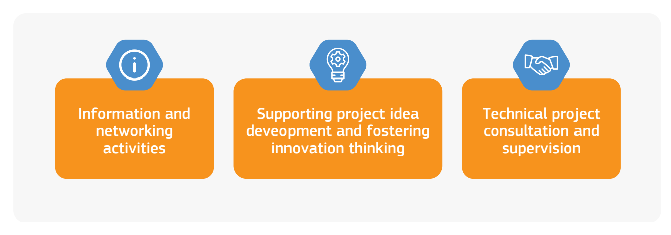
FIGURE 1: MAIN TASKS TAKEN ON BY THE STRUCTURAL PILOTS.